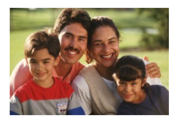
The buying power of Hispanics and other ethnic groups continues to grow rapidly.

Engaging in sound diversity practices long ago surpassed being a matter of fairness or good public relations. Top executives in many sectors – among them, consumer products and financial services – understand they need a work force that reflects the changing demographics of customers. They need to attract and retain talent that embraces diversity, in order to compete in the marketplace of ideas, products and services.